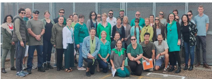
Albion Park High School Support Action on Climate Change